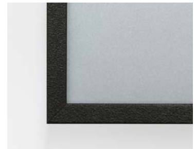
Stylish 3/8" beveled matte black frame creates an elegant, minimalist aesthetic